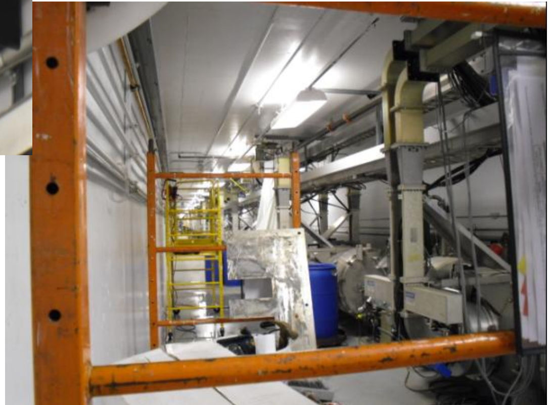
2L09 penetration repairs