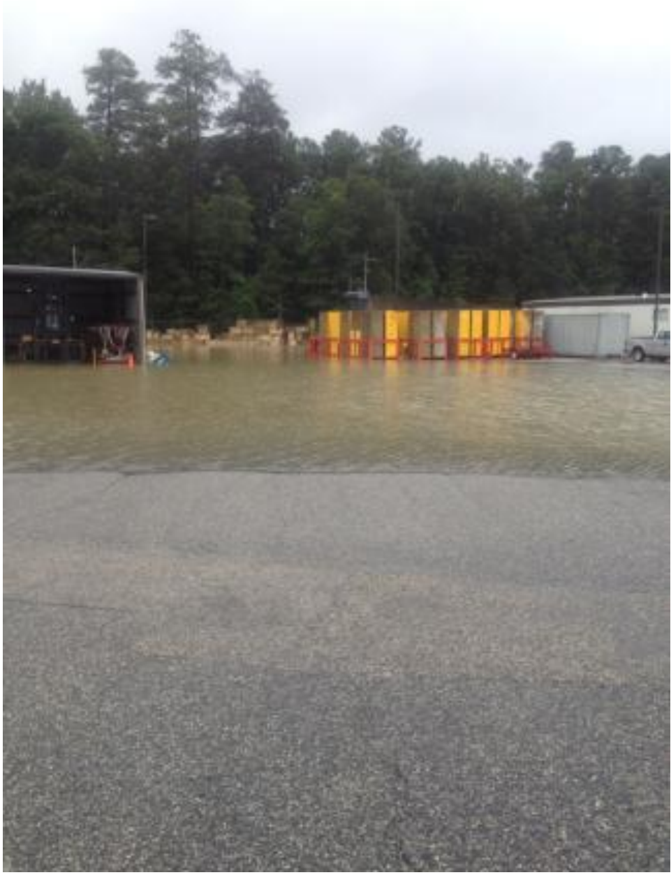
Flood waters at Forklift Shed