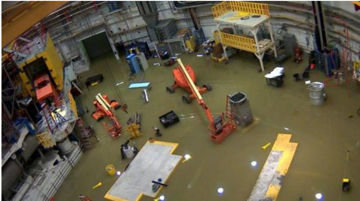
Hall C flooded, again