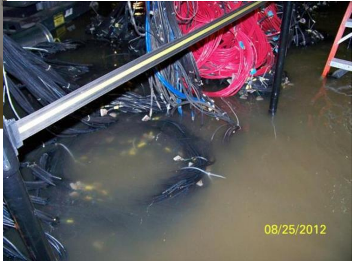
Hall B cables