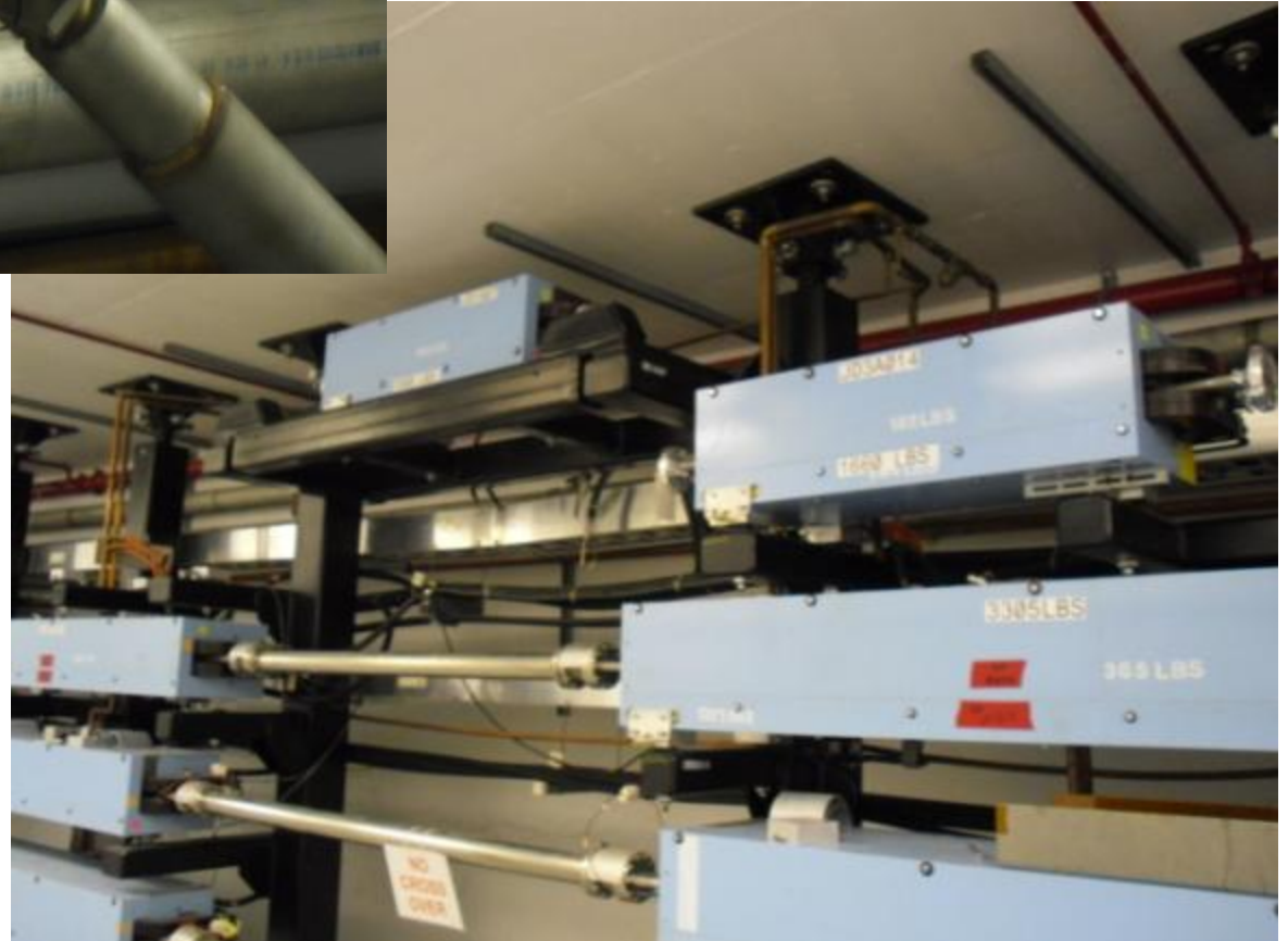
RTL Shield O-rings