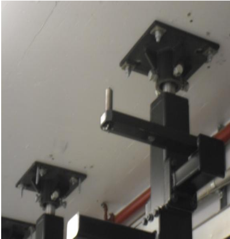
1R+ stand alignment