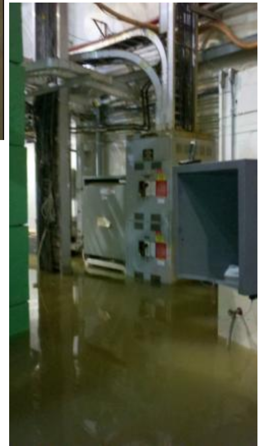
Hall C detail