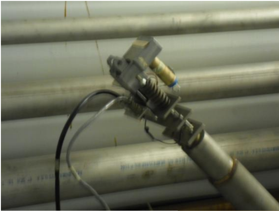
Arc3A dipole installation